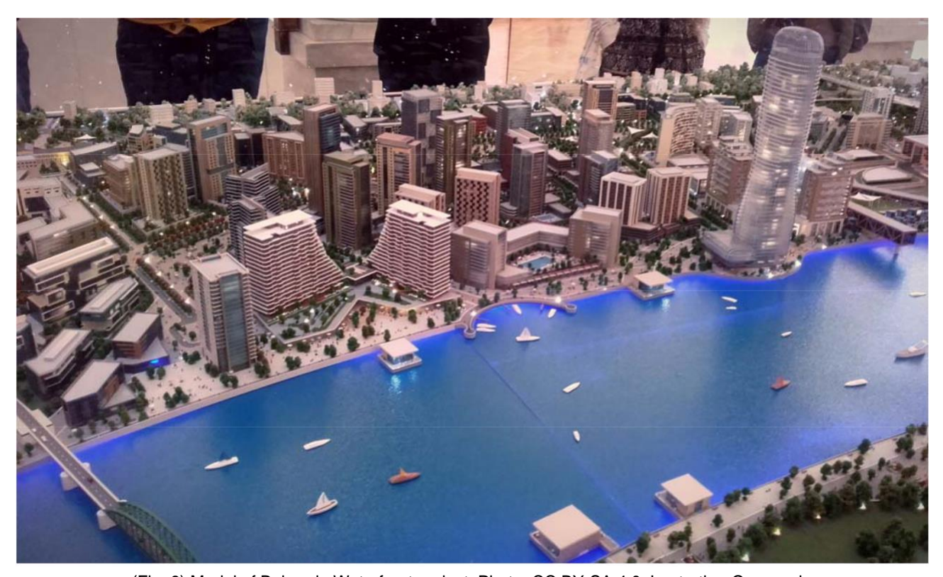
(Fig. 8) Model of Belgrade Waterfront project, Photo: CC BY-SA 4.0, Leeturtle - Own work, https://commons.wikimedia.org/w/index.php?curid=48994040

The BGWF Plan envisages the construction of two million m2 on 177.27 ha in three phases (8–30 years), with expected total investment of about €3.5 billion EUR to be invested by the Serbian government and Emirati partners. The project includes office and luxury apartment buildings (6128 flats), Belgrade Park, Sava Promenade, five-star hotels, Belgrade Mall and Belgrade Tower. Policy-makers promoted the BWP by emphasizing its role in creating new employment (for 200 000 people), in providing high-quality services, in enhancing tourism, etc. Project realisation started in 2014. with reconstruction of Belgrade Cooperative building in Savamala. Phase I included building of riverside residential development - BW Residences, whose construction started in 2015. In spite of expected positive effects, there are several challenges and risks that BGWF project brings. In spatial terms, it will for sure change the identity of Belgrade, but the question remains – for better or for worse. It has been already recognised in literature that generic architecture of BGWF reflects the global concept of neo-liberal "Dubaification" (Koelemaij, 2020) (fig. 8).