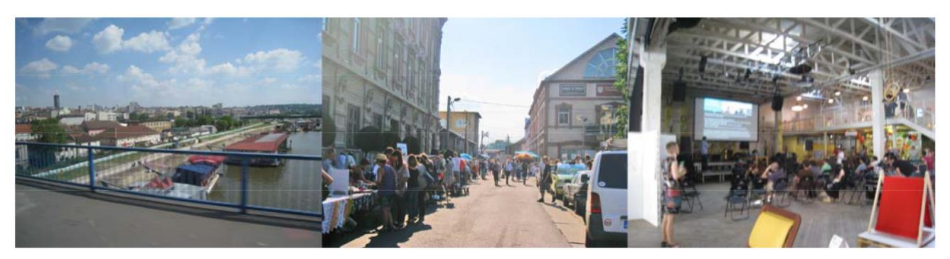
(Fig. 5) Savamala creative district

The second waterfront regeneration phase started in 2007, and reached its peak during 2012–2014, through the formation of Savamala creative district. The Savamala quarter is located in Belgrade's central Savski venac and Stari grad municipalities, and stretches along the right bank of the Sava River and Karadjovdjeva Street. Due to development of Sava Port in the mid 19th century, it became the vibrant economic and cultural centre of Belgrade. After relocation of the Port facilities to the Danube River, and with formation of the new urban centre on the top of the hill, Savamala area was neglected for decades. But its rich cultural and architectural heritage, combined with traffic bottleneck and vivid street life, created specific atmosphere that constantly attracted tourists and artist (Cvetinovic et al., 2016; Vanista et al., 2016).