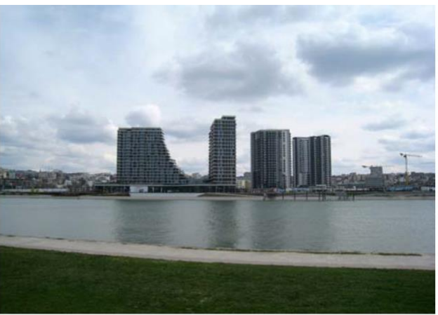
(Fig. 9) Belgrade Waterfront project in 2016 and 2020, Photo: Jelena Zivkovic

Besides that, the recent research on legislative mechanisms, contractual strategies and modes of governance involved in the BGWF project's delivery (Grubbauer and Camprag, 2019; Zekovic et al. 2018; Lalovic et al., 2015) points out that BGWF can be considered "as an extreme example of state-led regulatory intervention, characterised by lack of transparency and haste in decision-making processes, all of which serve to prioritise private investors' interests in project delivery above the principles of representative democracy" Grubbauer and Camprag, 2019:649). In addition, there was a low level of public informing, the citizens were mostly excluded from the decision-making process and the protests of citizens and NGOs, initiated due to all above mentioned problems, clearly reflect insufficient transparency and democracy in the planning of BGWF (Zekovic et al., 2018)(fig. 9).