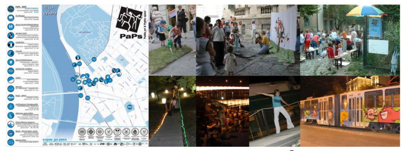
(Fig. 3) Step towards the River by Public Art & Public Space, Photo: © PaPs archive