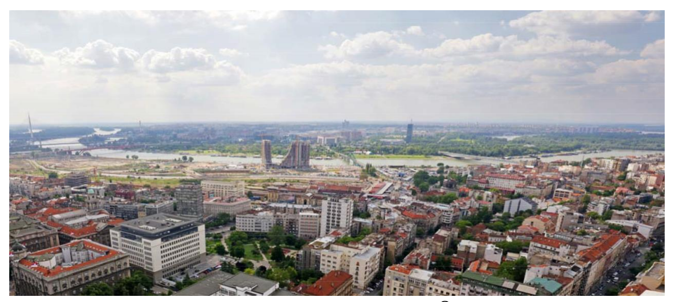
(Fig. 7) Location of the Belgrade Waterfront project

The location of this mega-project is the area of wider Savamala that includes Sava amphitheatre. Sava amphitheatre is an important city location that has been a subject of many studies and visionary projects. The Master Plan of Belgrade 2021 treats the location as one of the most valuable in Belgrade, while recognizing large projects as instruments for the Plan implementation (Radosavljevic, 2008). Therefore, how this area will develop and how public interest will be achieved, is an important task in waterfront regeneration process (Lalovic et al., 2015) (fig. 7).