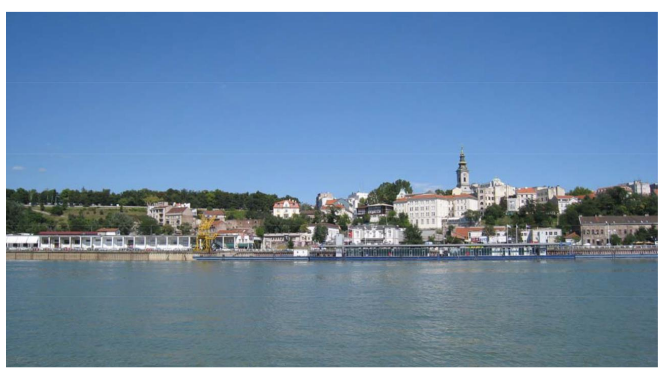
(Fig. 1) Sava waterfront in Belgrade