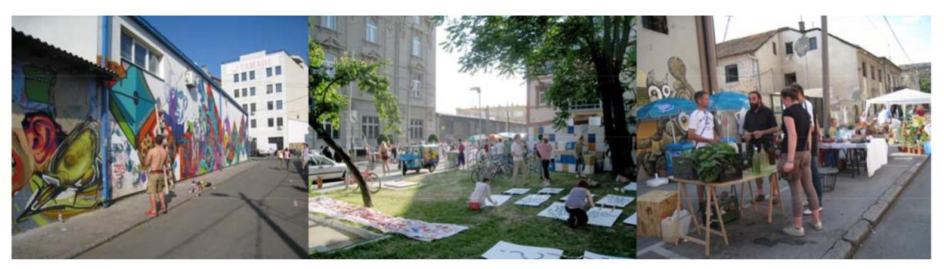
(Fig. 6) Savamala - Mixer festival