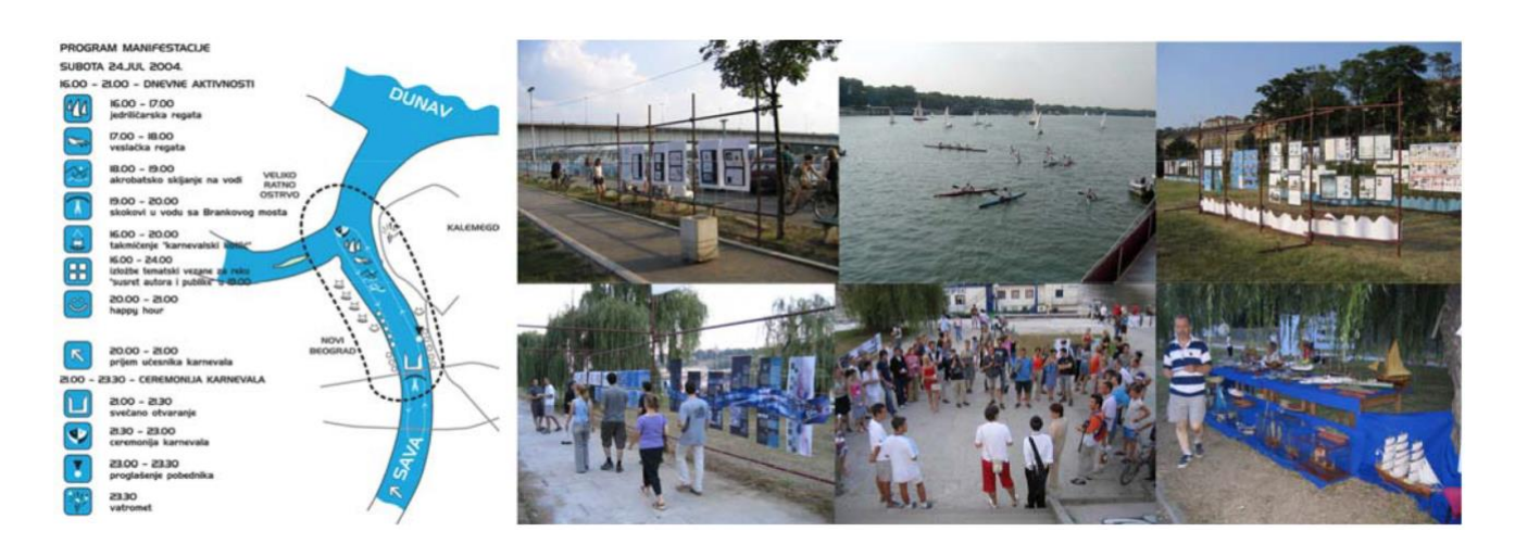
(Fig. 4) Belgrade Boat Carnival by Public Art & Public Space

b) Project "Belgrade Boat Carnival" - Building on "Step towards river" success, the aim of the second PaPs project was to organise a big event that will celebrate Belgrade's rivers and showcase its riverbanks as lovable public spaces. This is how the idea of the "Belgrade Boat Carnival" was born. The one day event took place on 24th of July 2004. in the former Sava port area and included: events on the riverside (student design exhibition, children's theatre and workshops, boat models exhibition, fish soup cooking competition), daily events on the river (water jumps, sailing boats, rowboats and jet ski parade) and final event - 250 boats in a carnival parade (fig. 4). More than 100,000 people attended this event. Next year, "Belgrade Boat Carnival" became an official Belgrade's special event.